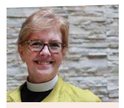
Why the world needs faith