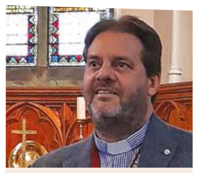
26 Seeing the spiritual