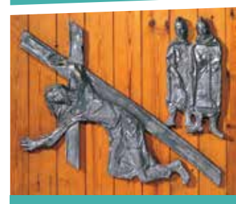
Station VII, Jesus falls for the second time