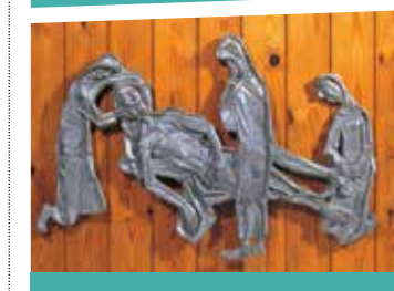
Station XIV, The entombment (Jesus is laid in the sepulchre)