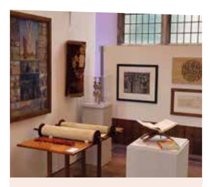
8 Articles for faith