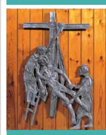
Station XIII, The deposition (Jesus taken down from the cross)