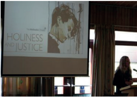
The Vice-President reminds us about justice, Sophie Scholl and the White Rose